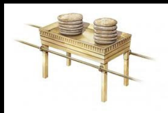
Table of showbread