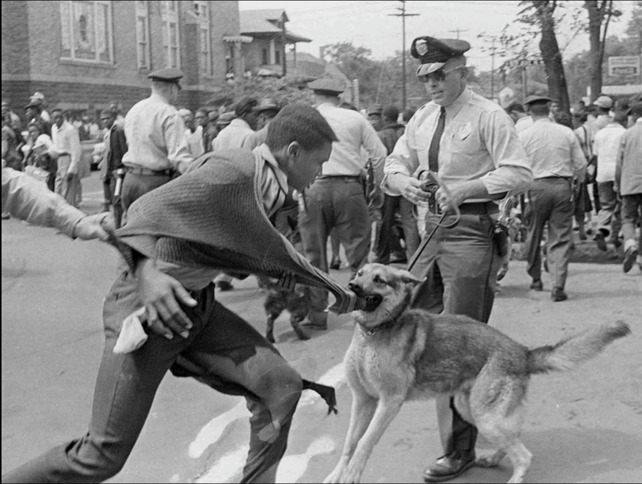
Civil Rights Movement