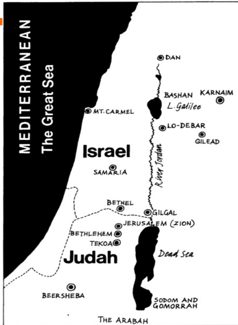
The places in Israel and Judah mentioned in the book of