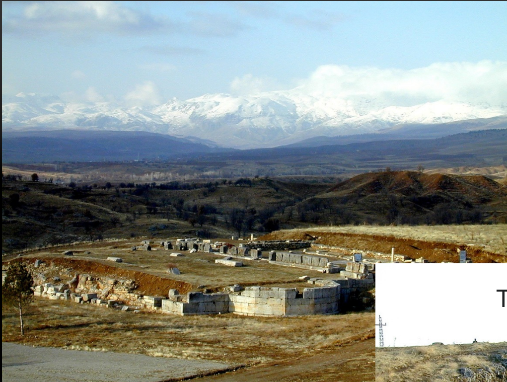
Temple of Augustus