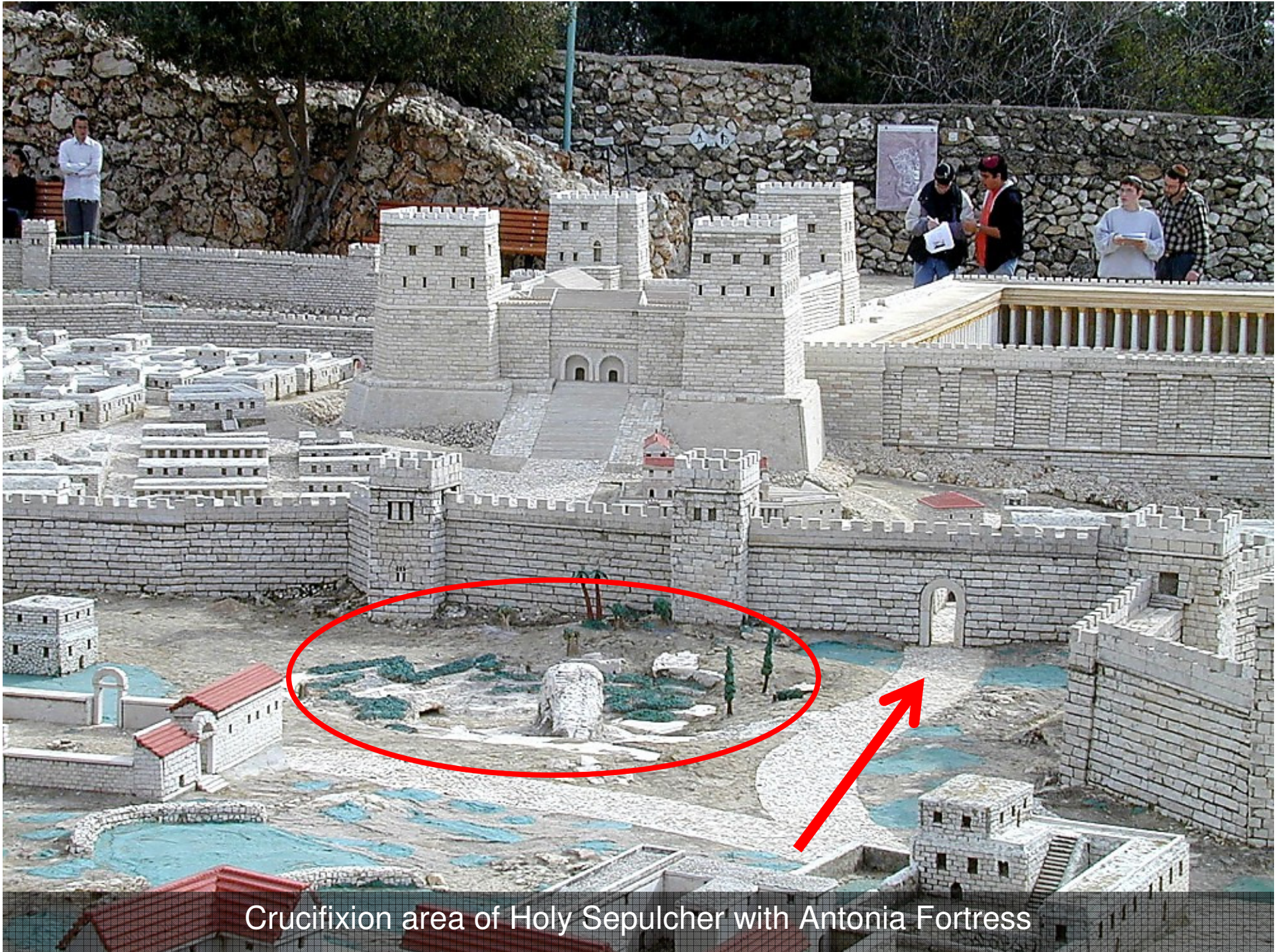
Crucifixion area of Holy Sepulcher with Antonia Fortress