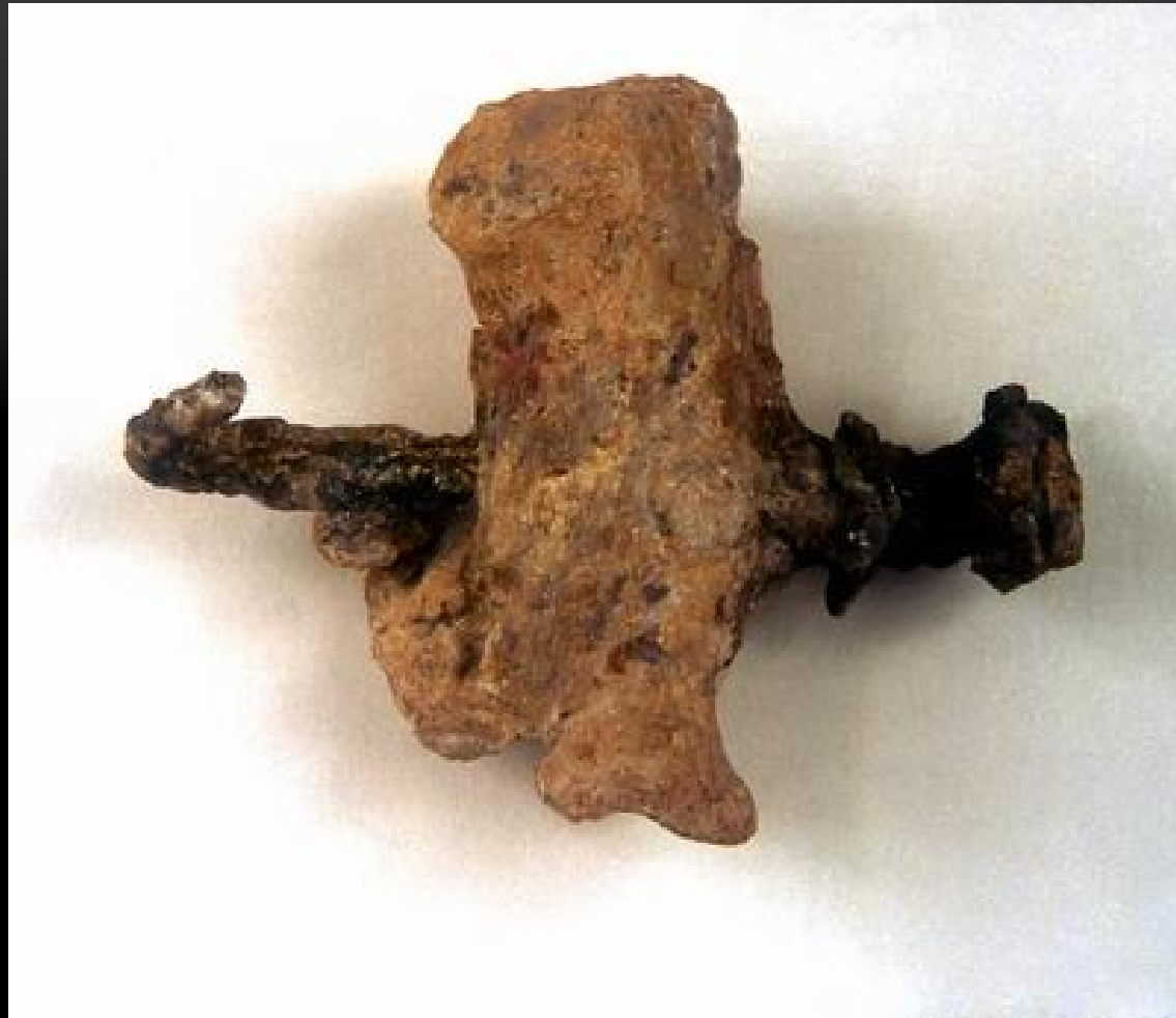
Heal bone pierced by iron nail