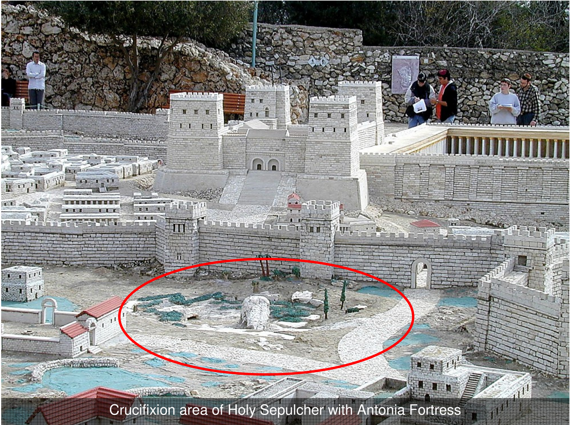
Crucifixion area of Holy Sepulcher with Antonia Fortress